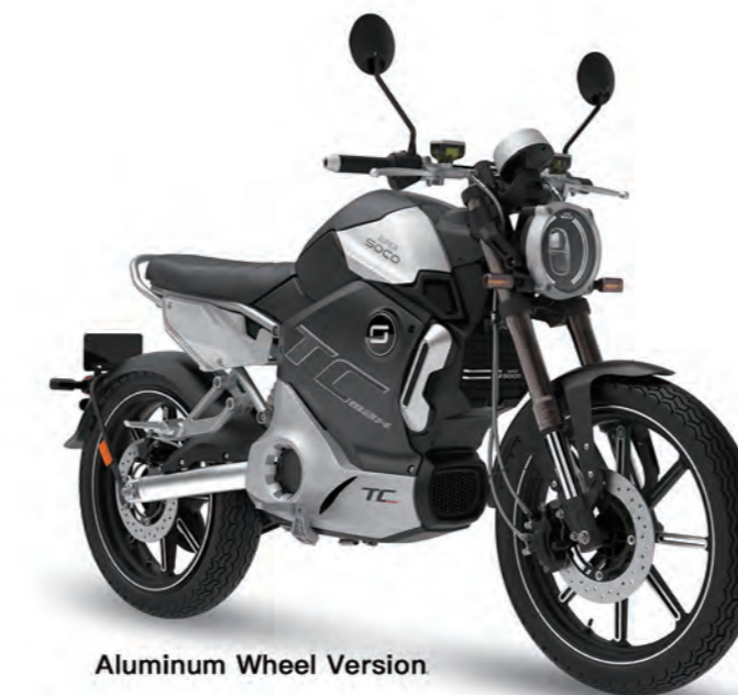
Aluminum Wheel Version

* The data come from the corporate laboratory tests in ideal conditions and all data are for reference only.