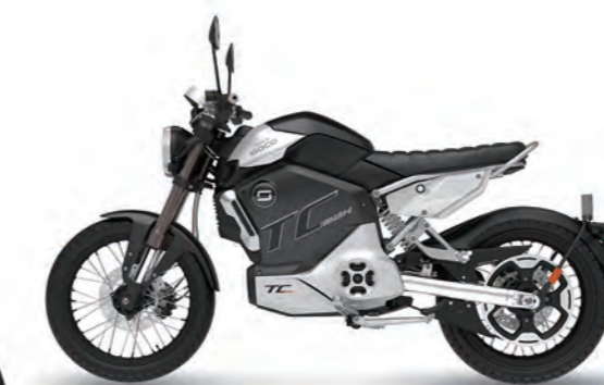
Spoke Wheel Version